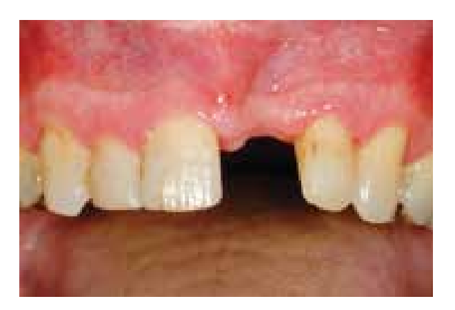
Figure 2: Pre-operative clinical photograph showing anterior close-up view of the patient.