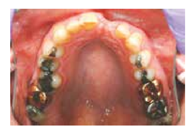
Figure 3: Pre-operative clinical photograph showing occlusal view of the maxillary arch.