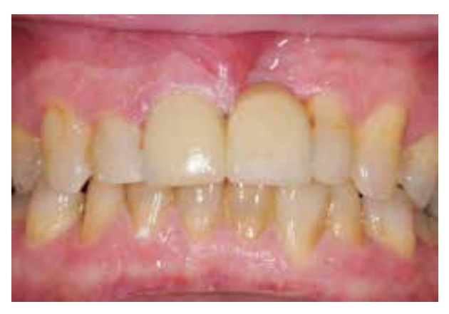
Figure 5: Post-operative clinical photograph showing anterior close-up view of the patient.